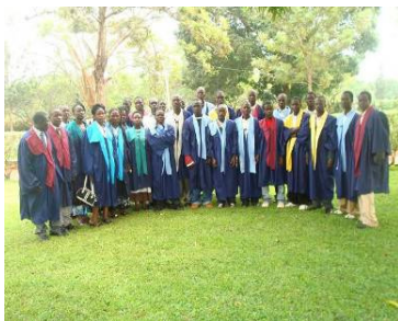
Youths after graduation at NVI

53 youths out of the 140 sponsored by BEL completed a one-year basic skills training at Nile Vocational Institute and graduated on 4th December 2009. They were awarded certificates in different skills: Block laying and concrete practice (16), Catering and Hotel management (2), Carpentry and Joinery (6), Hair dressing and beauty therapy (9), Motor vehicle mechanics (9), Plumbing and Sheet Metal work (3), Textile technology (7) and Electrical Installation and Electronics (1).