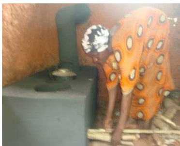
One of the vulnerable persons using the energy saving stove