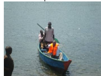
Fishermen using one of the boats and life jacket provided to them by BEL

The fishing equipment provided to the Fishers by BEL is being used as seen in the picture below