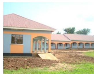
10-classroom block at Naminya RC primary school was completed

Construction works for the 10-classroom block at Naminya RC Primary School were completed. Classrooms to be furnished and handover slated for March 2010.