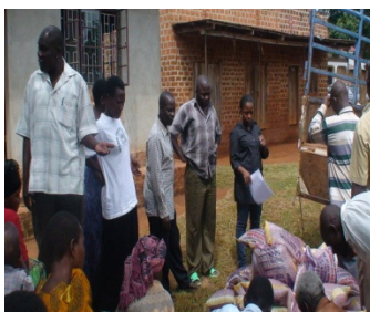
Beans (K132) being distributed in the community

Livestock production in the project area has continued to perform well. To date, 127 piglets and more than 40 kids have been produced.